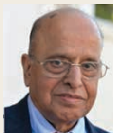
Dr. K. Kasturirangan, Ex-Chairman, Indian Space Research Organisation