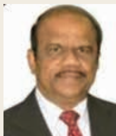
Dr. Sivathanu Pillai Honorary Distinguished Professor at Indian Space Research Organisation