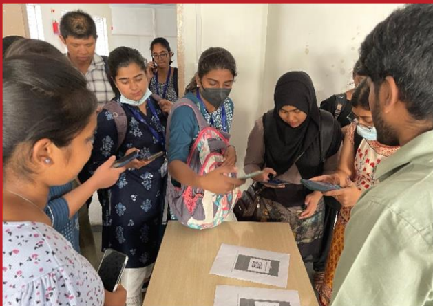
Welcome Desk & Registration