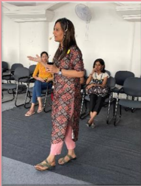
Reflecting on the activity