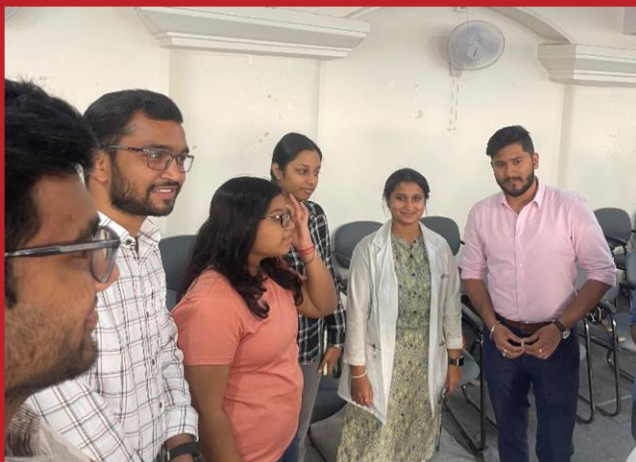
Preparing for the Group Presentation