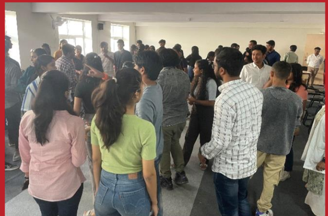
Finding your Tribe