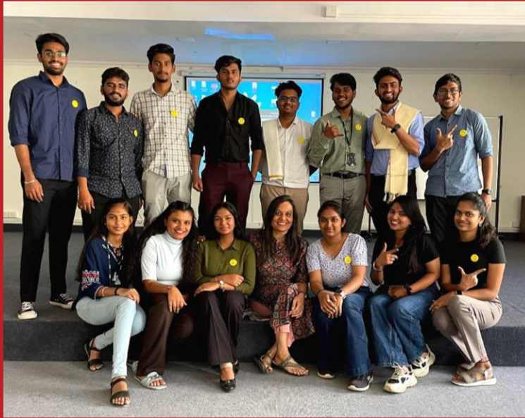
The Core Team