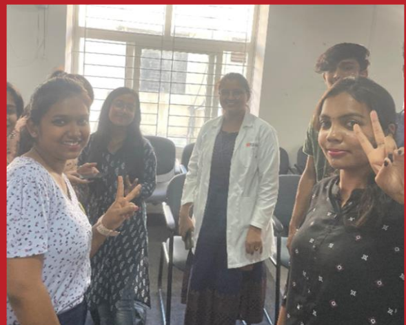
Ready to Rock!