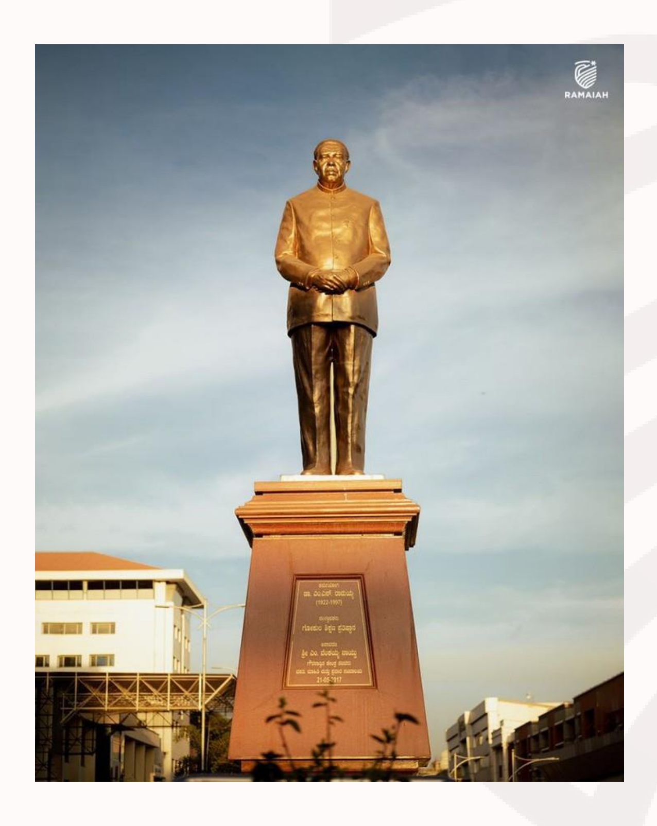
Celebrating 100 years of Ramaiah